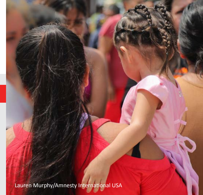
Lauren Murphy/Amnesty International USA