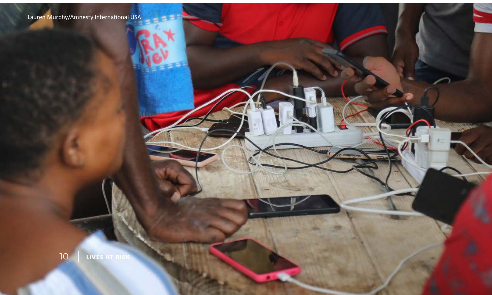
Lauren Murphy/Amnesty International USA

was known to have received an appointment on the day we visited. Indeed, DHS has indicated that, even with its slight increase of appointments post Title 42, it is providing only one thousand CBP One appointments across the entire border and other areas where the app is available. When the number of current appointments was shared with a large group of Haitians waiting to seek asylum, there was an audible gasp across the group out of despair about the few appointments available in contrast to the numbers that have been waiting and waiting for appointments. Many other people seeking asylum also expressed frustration with the lack of appointments available. The highly limited number of appointments available, along with U.S. and Mexican government actions blocking people from seeking asylum without appointments at ports of entry, violates U.S. refugee law and amounts to unlawful metering. Under both domestic and international human rights law, the United States is obligated to provide access to individualized and fair assessments of all requests for protection by people seeking refuge at the border, in a way that does not discriminate based on manner of entry or immigration status.