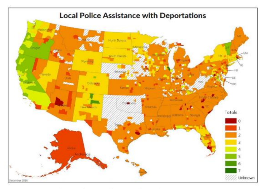
Excerpt from the ILRC's Searching for Sanctuary Report

Using this previous FOIA data, the ILRC developed a seven-tiered system to categorize counties in terms of their cooperation with federal law enforcement and used this rubric to better inform the public regarding the nature of a county's cooperation with ICE.<sup>32</sup> Additionally, the ILRC created the most comprehensive map of state and local "sanctuary" policies, and included this map as one of the key features in the Searching for Sanctuary report:<sup>33</sup>